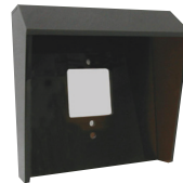
Plastic Rain Shield