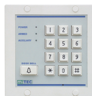
with Bell Button