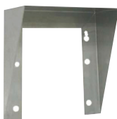
Stainless Steel Sunshield

Dimension MDP-SS01 : 140W x 150H x 80D mm MDP-SS11 : 140W x 150H x 110D mm