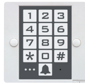
with Bell Button